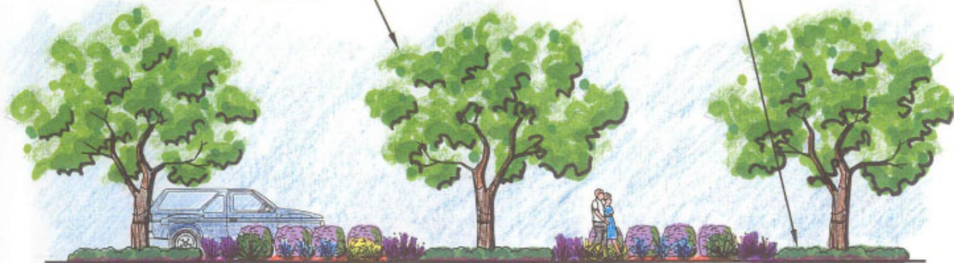
ELEVATION A - A'