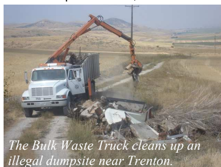
The Bulk Waste Truck cleans up an illegal dumpsite near Trenton.