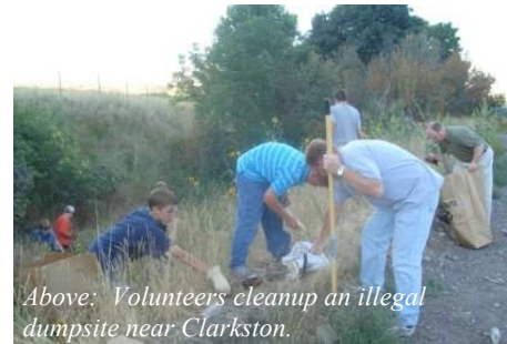
Above: Volunteers cleanup an illegal dumpsite near Clarkston.