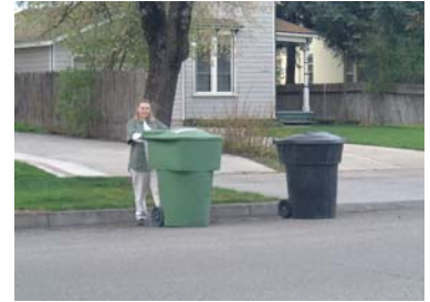
The new Green Waste container along side the Black Beauty garbage container.

Applications are available at local city offices or at Logan City Service Center, 950 W. 600 N. in Logan. For more information please contact the Cache Valley Clean Team at 716-9753.