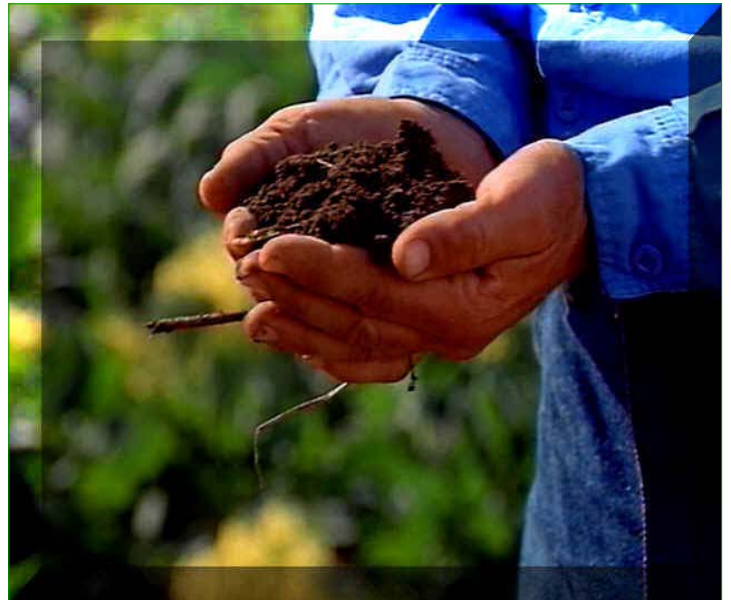
Compost sold at the Green Waste facility

The Green Waste facility is located at the Logan Landfill 200 N. 1400 W. Logan.